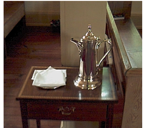
Oblation table for the 11 a.m. service. Place a small offering plate on this table along with the flagon and bread for the 9 a.m. service.