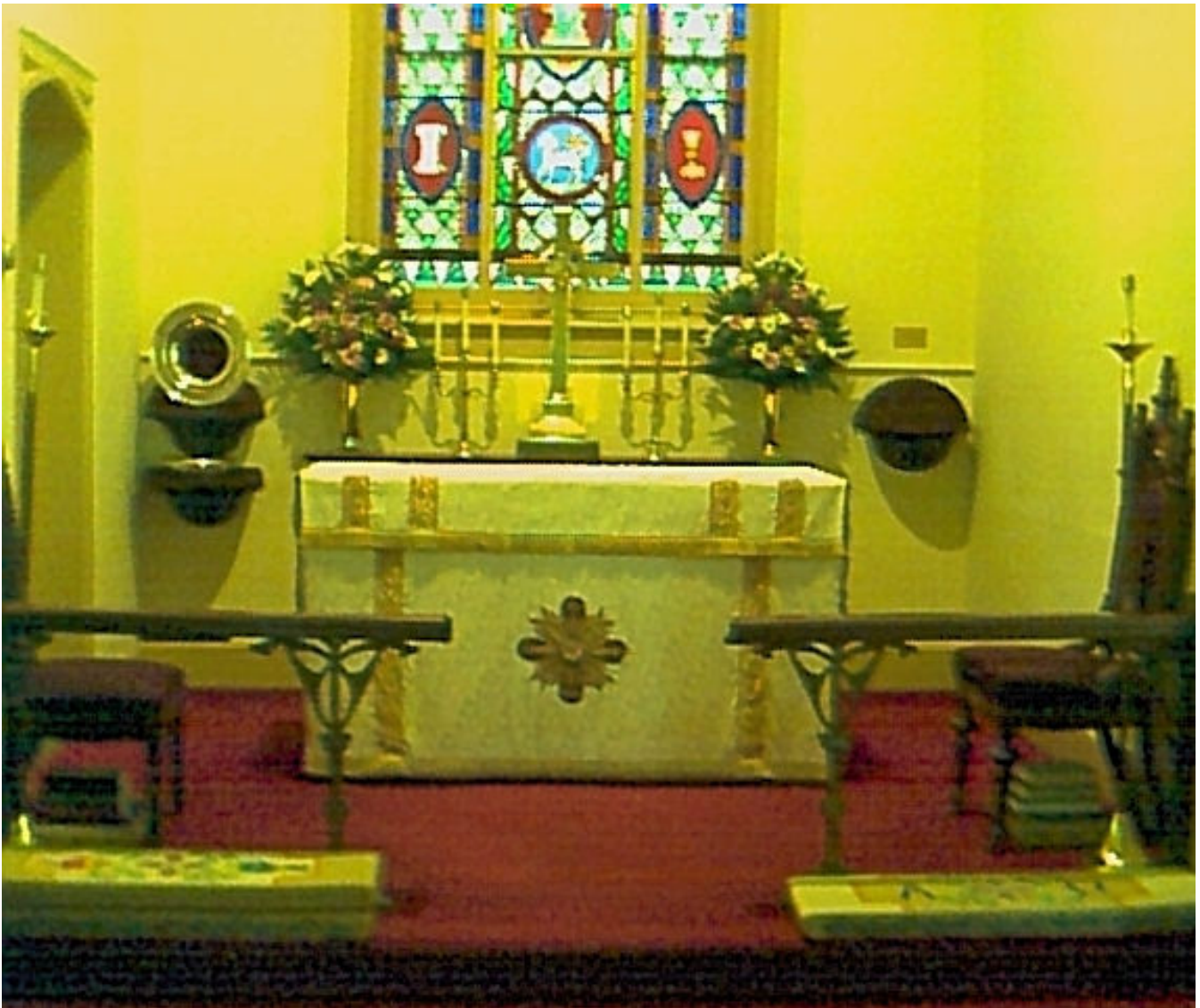
Standard setup for Morning Prayer at 11 a.m. Note that the offering plates are now placed on the window sill in the back of the church.